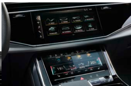
MMI navigation plus with MMI touch response