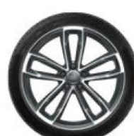
Cast aluminum wheels, 5-spoke Cavo (S design), contrasting gray 8.5J x 19, 255/35 R19 tires