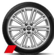
Audi Sport cast alloy wheels 10-spoke V-style 8.5J x 19, 255/35 R19 tires