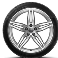
Alloy wheels, 5-parallel-spoke style 8.5J x 19, 255/35 R19 tires