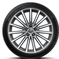
Cast aluminum wheels 19 inch, in multi-spoke design, contrasting gray 8.5J x 19, 255/35 R19 tires