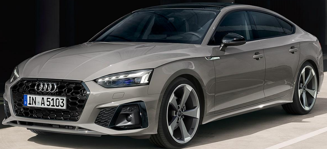
Audi A5 Sportback