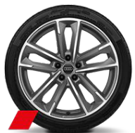
Audi Sport cast alloy wheels, 5-double-arm style, Matte Titanium Look, diamond-turned, 8.5J x 19, 255/35 R19 tires