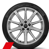
Audi Sport cast alloy wheels, 10-spoke star style, Platinum Look, diamond- turned, 8.5J x 19 255/35 R19 tires