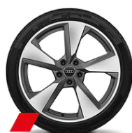
Audi Sport cast alloy wheels, 5-arm pylon style, Matte Titanium Look, diamond- turned, 8.5J x 19, 255/35 R19 tires