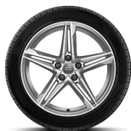
Alloy wheels, 5-double-spoke star style 8.5J x 18, 245/40 R18 tires